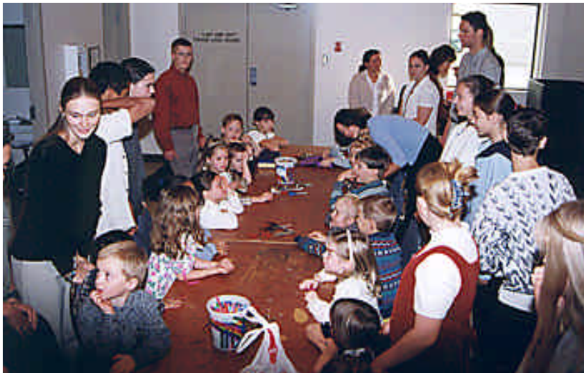
Children prepare for Festival lessons.

Children looked forward to specially prepared festival lessons that illustrated the plan of God. Many teens took this opportunity to serve as big brother or sister to younger children in these fun-filled activities. Artwork by the youngsters picturing the World Tomorrow was later displayed for all to enjoy.