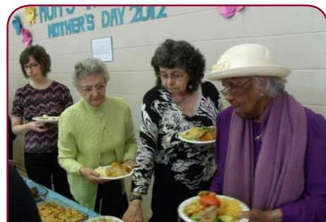
Toronto honours Mothers

treated to beautifully wrapped gift of toiletries and an assortment of delicious Lindt chocolates. Inspiring scripture verses were strategically placed at the opening of each package.