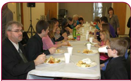
Ottawa brethren enjoying a meal together.

On April 5 in Kemptville, Ontario, 19 people gathered together as a full moon slowly rose through a scattering of clouds. As the golden shafts lit the sky above, people bowed their heads in acknowledgment and prayer as they thanked God for the wonder of His Son's last Passover and its meaning - the symbolism wrapped up in the partaking of wine and unleavened bread. The beauty and wonder of this great gift had been preceded by the foot-washing ceremony - a tremendous lesson in humility through Christ's example. Carried down through millennia we symbolically, once again, repeated this great event. For some this would be their 45th time coming together in giving thanks for the wonder of God's great love bestowed upon us.