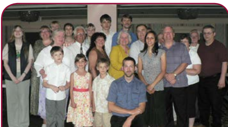
Our New Brunswick brethren after services