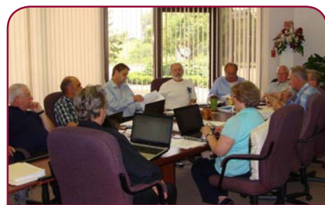
National Council meeting in Toronto